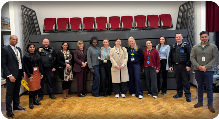
Parkside Studio College Open Evening

This event was made possible with the support of the Hillingdon Mental Health Support Team, The Attendance Support Officer for London Borough of Hillingdon, the Hillingdon Schools Nursing Team, Family Lives, The Metropolitan Police and our dedicated SEN support staff . Their presence provided valuable information and guidance on a range of topics, helping to strengthen our network of support for pupils and families. A huge thank you to everyone who attended - we hope you found the morning both enjoyable and informative.