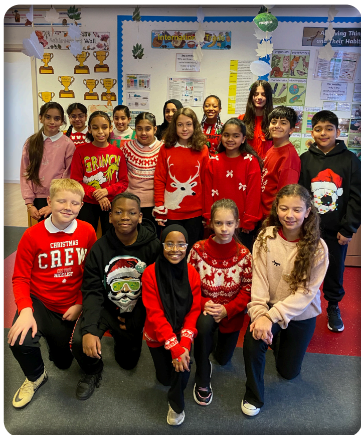
Hospital Carolling Visit