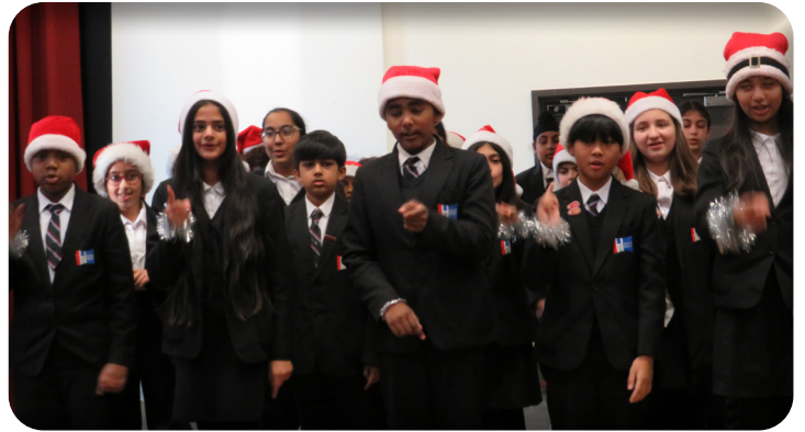
Oh, Christmas Tree, Oh, Christmas Tree!