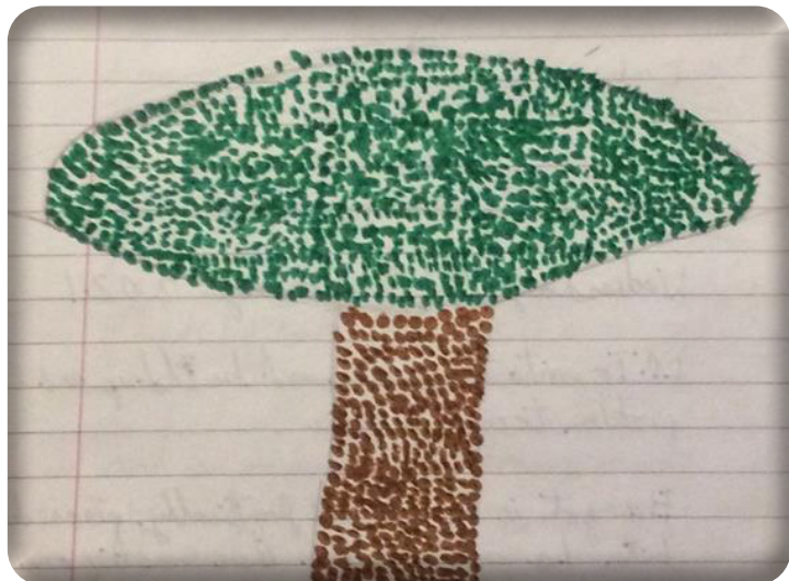
Rajpaul - ASH