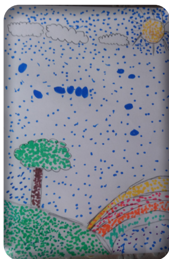
Deen - HOLLY