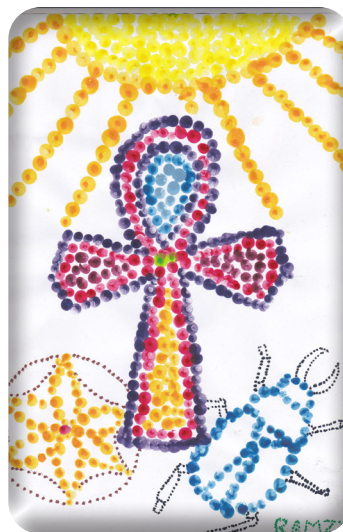
Ramzy - ASH