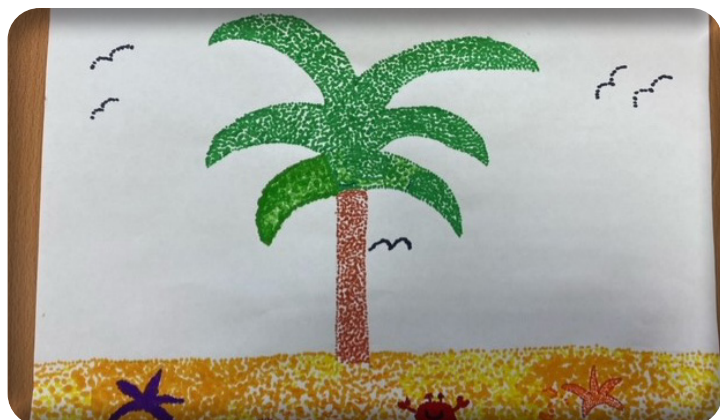
Aamir - HOLLY