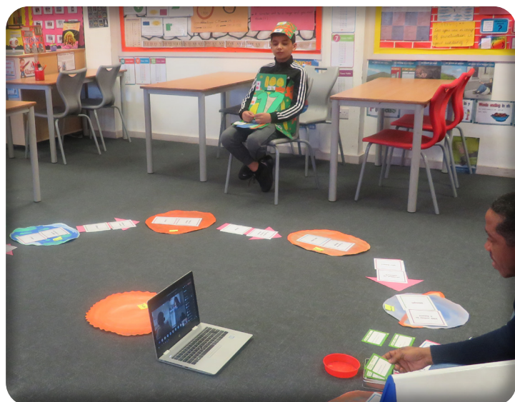
Year 6 went on a journey in space with the aim of measuring time. The children went on a quest to explore different planets by working out the distance, speed and time travelled as they tried to get to Earth safely in groups named: Saturn Surfers, Mercury Martians, Venus Vikings and Cosmic Crusaders.