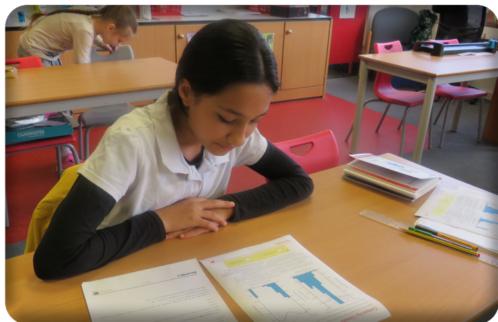
Year 5 investigated 'Maths in Weather'. The children looked at climate graphs for London and compared the weather to different countries of the world.