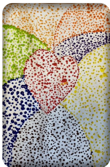
Isaac - HOLLY